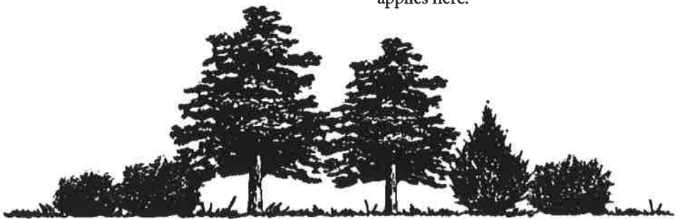
Figure 2: Ladder fuels enable fire to travel from the ground surface into shrubs and then into the tree canopy.