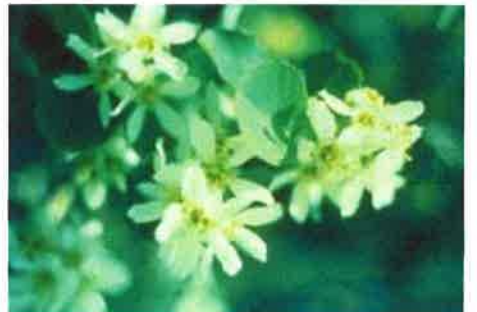
Figure 9: Serviceberry ( Amelanchier alnifolia )