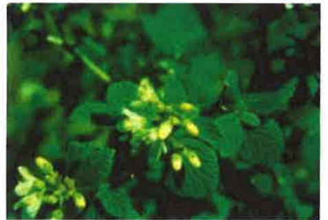
Figure 8: Waxflower ( Jamesia americana )