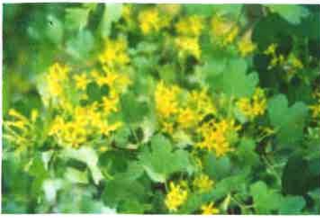
Figure 2: Golden currant ( Ribes aureum )