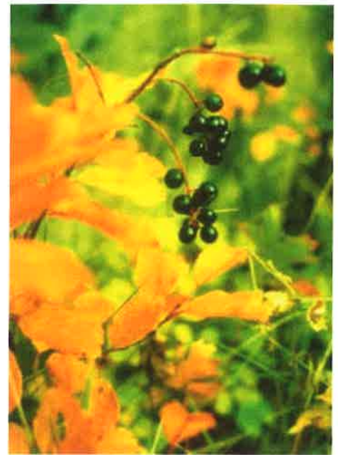
Figure 6: Western chokecherry ( Prunus virginiana melanocarpa )

Using native shrubs offers many benefits in addition to reduced maintenance. Natives are part of our natural heritage and the ecosystems of Colorado. Native plant communities make Colorado visually distinct from the eastern, southern or western United States. Native plant gardens are wildlife habitats and each plant contributes to the biodiversity of the state.