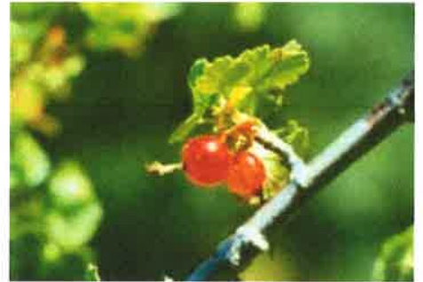
Figure 7: Wax currant ( Ribes cereum )