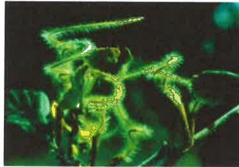
Figure 1: Mountain-mahogany fruit ( Cercocarpus montanus )

Most of the shrubs listed in Table 1 are available as container-grown plants. Native shrubs often do not have as great a visual impact in the container or immediately after planting as do traditional horticultural species. Over time, they will reward the homeowner with their natural beauty and other benefits.