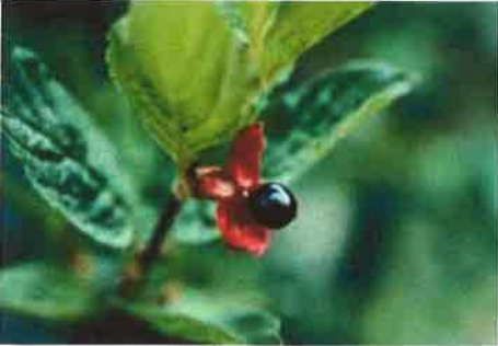
Figure 3: Twinberry fruit ( Lonicera involucrata )