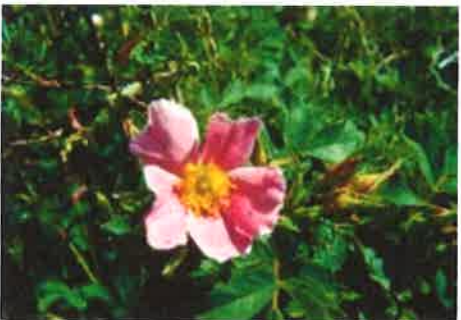
Figure 5: Wild rose ( Rosa woodsii )

within the non-native landscape. These native “pocket gardens” can be located in areas such as parkways and next to hardscapes that are difficult to irrigate.