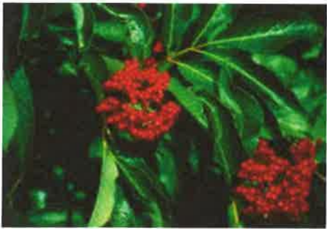
Figure 4: Red-berried elder ( Sambucus racemosa )