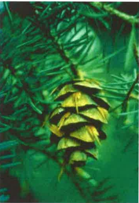
Figure 5: Douglas-fir cone ( Pseudotsuga menziesii )

Growing native trees does not exclude the use of adapted non-native plants. There are many non-native plants that are adapted to Colorado's climate and can be used in a native landscape as long as moisture, light, and soil requirements are similar. If a site has a non-native landscape that requires additional inputs (such as an irrigated landscape on the plains), dry land native plants can be used in non-irrigated pockets within the non-native landscape. These native "pocket gardens" can be located in areas such as parkways and next to hardscapes that are difficult to irrigate.