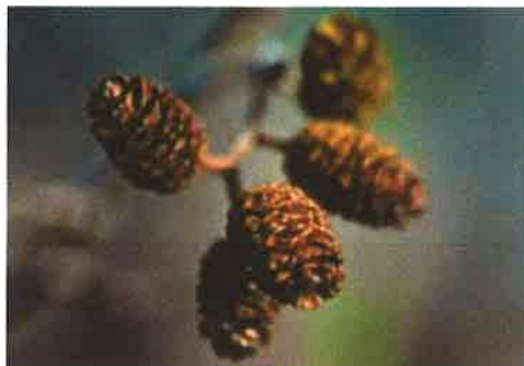
Figure 2: Alder fruit ( Alnus tenuifolia )