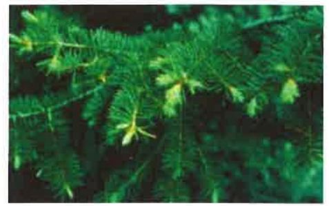
Figure 6: Douglas-fir ( Pseudotsuga menziesii )

The Foothills life zone occurs from 5,500 to 8,000 feet and is dominated by dry land shrubs such as Gambel oak and mountain-mahogany, and in southern and western Colorado, piñon-juniper woodlands and sagebrush. The Montane zone consists of ponderosa pine, Douglas-fir, lodgepole pine, and aspen woodlands at elevations of 8,000 to 9,500 feet. Dense forests of Subalpine fir and Engelmann spruce dominate the Subalpine zone at 9,500 to 11,500 feet. The Alpine zone above 11,500 feet is a treeless zone made up of grasslands called tundra. Species requiring medium to high moisture occur along watercourses throughout all zones.