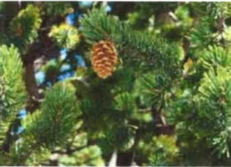
Figure 4: Bristlecone pine ( Pinus aristata )