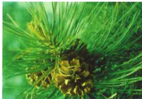
Figure 1: Ponderosa pine cones ( Pinus ponderosa )

There are several factors to consider when designing a native landscape. Due to Colorado's variation of elevation and topography, native plants are found in many habitats. In order to maximize survival with minimal external inputs, trees should be selected to match the site's life zone and the plant's moisture, light, and soil requirements. Even if a plant is listed for a particular life zone, the aspect (north, south, east, or west facing) of the proposed site should match the moisture requirement. For example, a blue spruce, which has a high moisture requirement, should not be sited with plants of dissimilar water needs. Similarly, a blue spruce should not be planted on a south-facing slope, where a significant amount of additional moisture would be required.