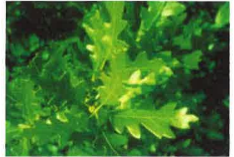
Figure 7: Gambel oak ( Quercus gambelii )