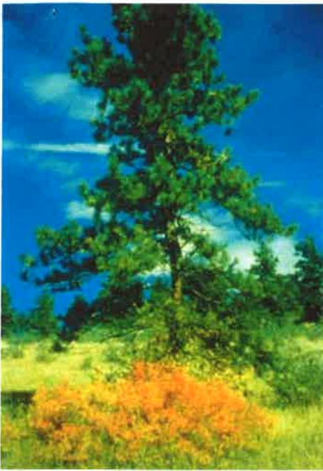
Figure 3: Ponderosa pine ( Pinus ponderosa )